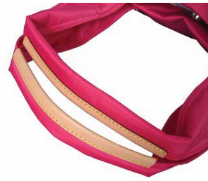
Reinforce the handle with Italian leather.