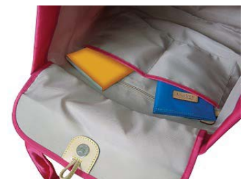
Many pockets inside the bag.