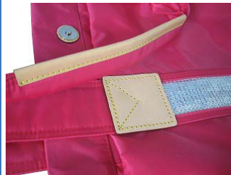
Using high quality Italian vegetable leather.