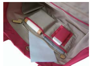
Useful organizer inside the bag.