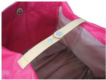
Convertible bag size by the hook.