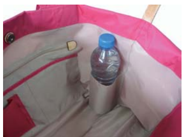
Bottle stand and zipper pocket inside the main room.