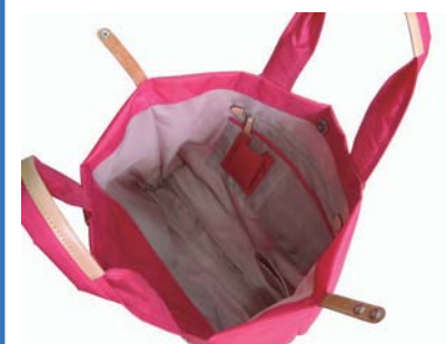
Large space in the main room.