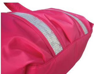
Tucks on the bottom make round shape.