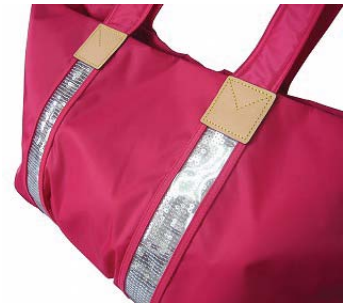
The nylon body material is coated by Teflon.