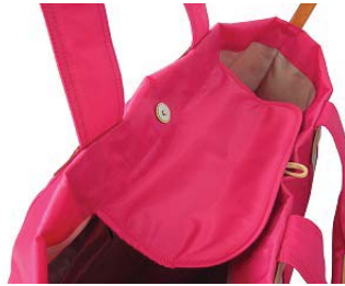
Magnet closed flap cover.