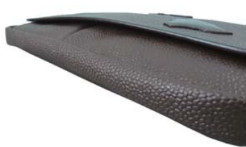
Italian leather is used for trim material.