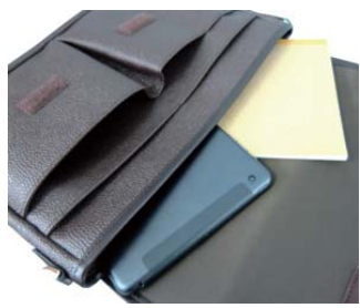
Good size for iPad.