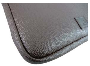
The bags made by special order durable PVC material.