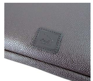
Lanai Transit Hawaii logo.