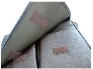
Easy to open and close the flap by velcro tape.