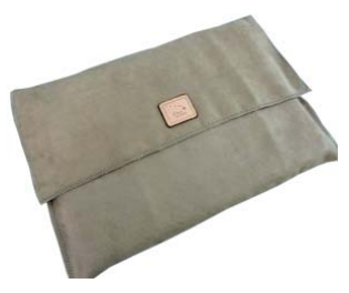
Cotton bags for keeping the bags in good condition.