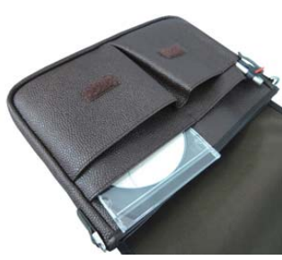
Useful pockets on front panel.