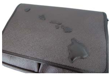
Lanai Transit Hawaii Island logo.