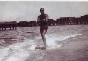
George Freeth is known for one of the people who introduced surfing to California for the first time. Same as Duke, he is a great water man who grew up in Waikiki.

Surfing may never have grabbed the publics and surfers imaginations any