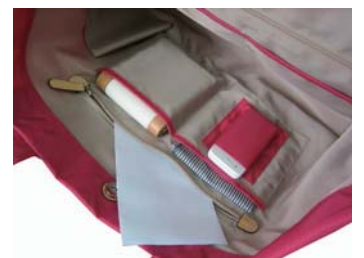
Useful organizer inside the bag.